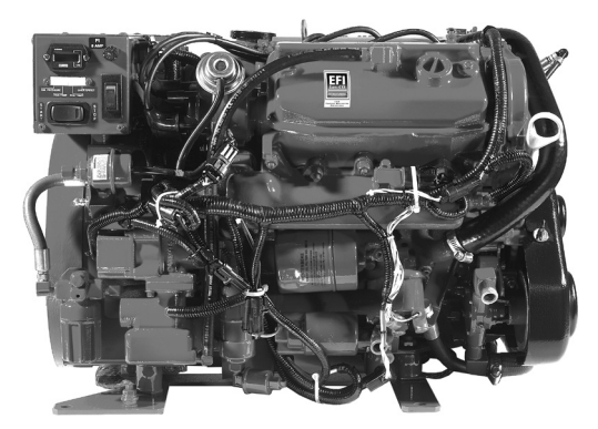
5.0 SBCG Marine Gasoline Generator

Westerbeke EFI, low-CO gensets are designed to operate in extreme ambient temperatures and incorporate a returnless fuel system to help eliminate fuel vapor-lock.